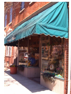
Pinkerton's Flower Factory 11 South Main Street 665-5456

birthday or just to let someone know that you are thinking of them, Pinkerton's can help make it happen! For store hours and more information, please visit their website at pinkertonsflowers.com or call 665-5456.